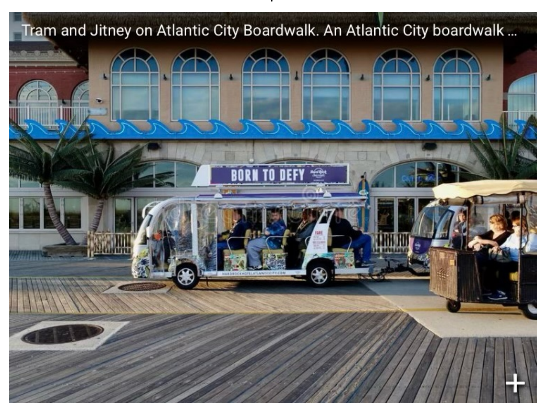
Attachment A: Examples of Eco Shuttles