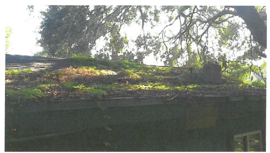
Photo 1 - Overhanging tree at east end of building over the Fish Market space. Much debris and lack of maintenance has caused this roof to fail allowing rainwater to enter.