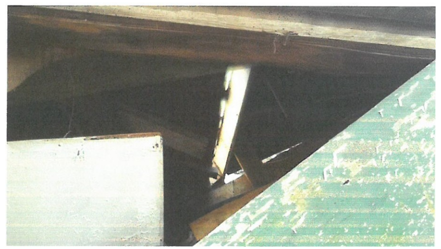
Photo 3 - Collapse of roof structure near center of building, as seen from rear window.

TEL: 843/342-5090 EMAIL: CPWENGR@HARGRAY.COM