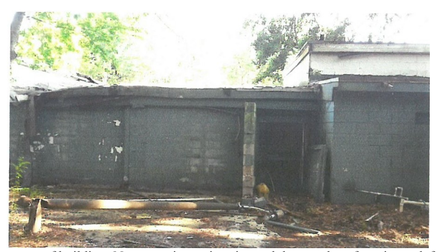
Photo 5 - Rear center of building. Note opening to interior and damaged roof section at left.