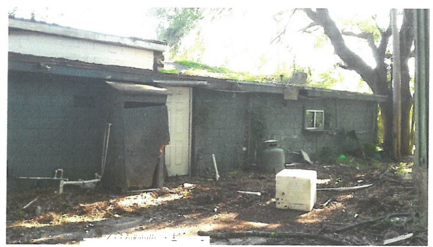
Photo 4 - East side of rear of building, behind the Fish Market and the Dress Shop. Note damaged roof fascia over window.

Morris C. Campbell August 24, 2017 Page 3 of 4