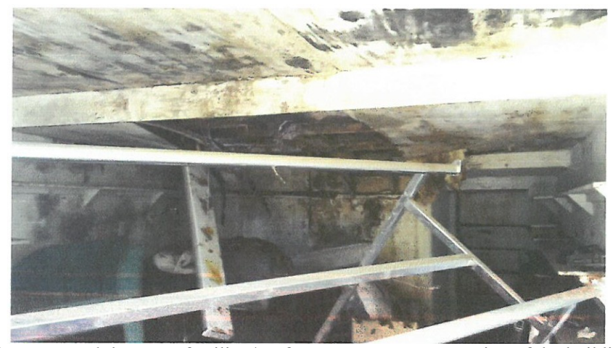
Photo 2 - Interior structural damage of ceiling/roof system near center portion of the building.