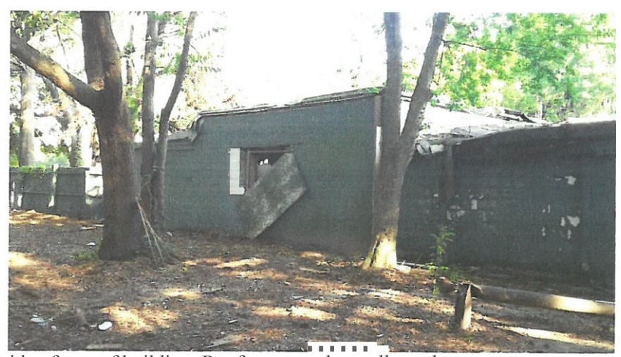
Photo 6 - West side of rear of building. Roof structure has collapsed.

TEL: 843/342-5090 EMAIL: CPWENGR@HARGRAY.COM