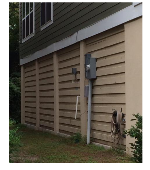
19 Jarvis Creek