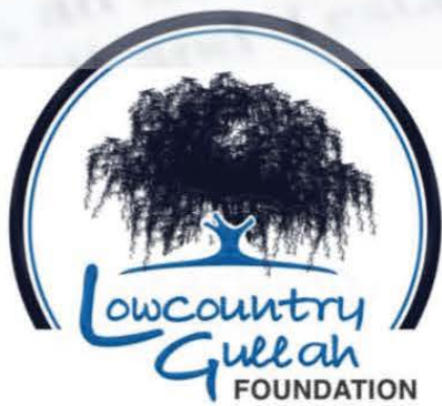
Lowcountry Gullah Fountdation