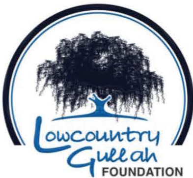
Lowcountry Gullah Fountdation