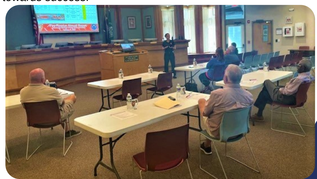
Community Stakeholder Meeting

Effective strategic planning benefits from a consistent and cohesively structured process employed across all levels of the organization. Planning is a process, not a document. While plans are developed regularly, it is the process that is important, not the final document alone. Planning has no clear beginning and no clear end. The most important element of the strategic plan is the opportunity to unify personnel and stakeholders through a common understanding of where the organization is going, how everyone can work to achieve common goals, and how progress will be measured as we work towards success.