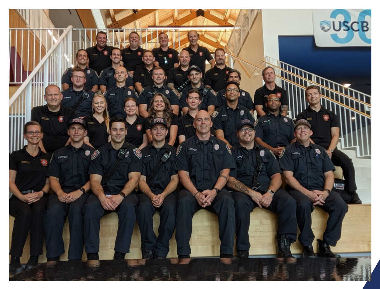
Department Stakeholder Workgroup

By adopting this Strategic Plan, Fire Rescue expresses a desire to implement a plan created through recommendations and input from the community and members of the organization. Leadership and active participation from all participants unifies the department and the community through a joint understanding of the department and its direction in order to achieve the mission, vision, and values. The success of the plan depends upon the implementation of goals and objectives, as well as support received from the community, members of the department, and the Town.