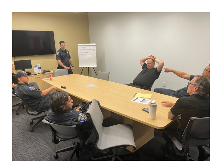
Department Stakeholder Workshop